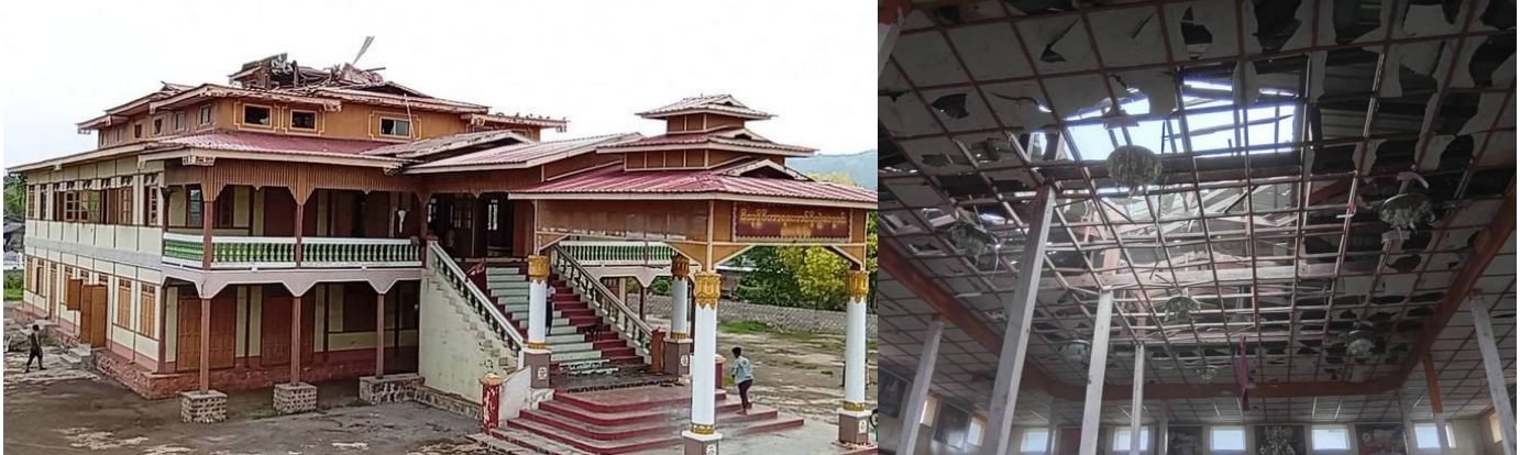
Lin Pok Daek temple damaged by SAC airstrike

On May 12, at around 11 pm, there was a SAC airstrike on Lin Pok Daek village, Lin Lam tract, 9 kms southwest of Chang Joi village, damaging Lin Pok Daek temple.