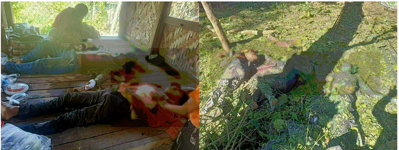
Casualties of Burma Army airstrike

These two airstrikes resulted in a total of eleven civilian deaths, including one pregnant woman and two children, and nine injuries. The majority of the casualties were IDPs from the towns of Mongkok and Mongmit who had fled fearing the re-entry of junta troops into the towns.